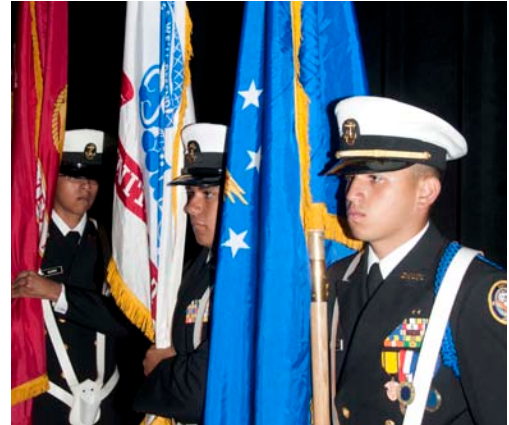
Students from Carson High School presented the colors at the reception.